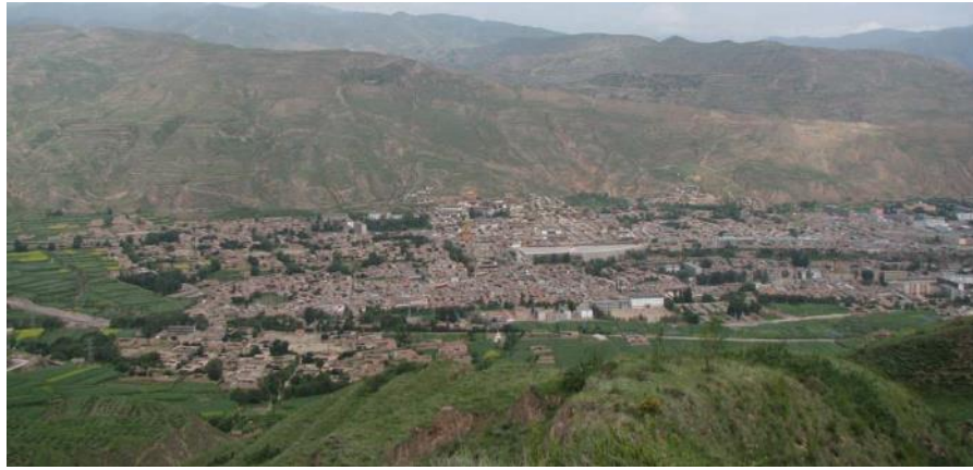
Jamo School - Rongwo Town in Rebong